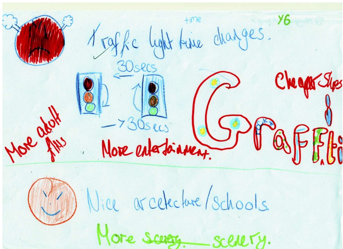
{Drawing by Year 6 pupils from St. Margaret's C of E Aided Primary School, Durham City, during the public consultation with children and young people, 2015}

2.21 Each of the key themes for the Plan has its 'champions' within the team of volunteers working on the Neighbourhood Plan now under the auspices of the Parish Council. Ideas for possible policies under each theme have been debated and revised, and always tested against the results of public consultations. There are constraints around what planning policies can address, notably that they have to be about the use and development of land, but the wishes expressed through public consultations and engagement have been incorporated as far as is possible either in 'Planning Policies and Proposals for Land Use' or in the initiatives in the companion document 'Looking Forwards: Durham as a Creative and Sustainable City'.