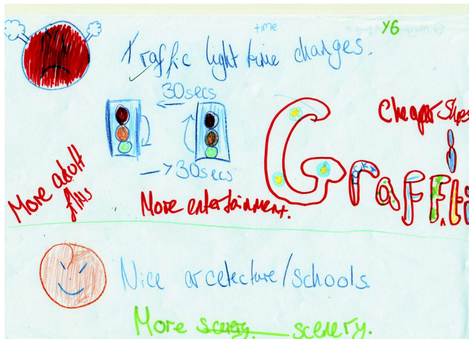
{Drawing by Year 6 pupils from St. Margaret's C of E Aided Primary School, Durham City, during the public consultation with children and young people, 2015}

2.21 Each of the key themes for the Plan has its 'champions' within the team of volunteers working on the Neighbourhood Plan now under the auspices of the Parish Council. Ideas for possible policies under each theme have been debated and revised, and always tested against the results of public consultations. There are constraints around what planning policies can address, notably that they have to be about the use and development of land, but the wishes expressed through public consultations and engagement have been incorporated as far as is possible either in 'Planning Policies and Proposals for Land Use' or in the initiatives in the companion document 'Looking Forwards: Durham as a Creative and Sustainable City'.